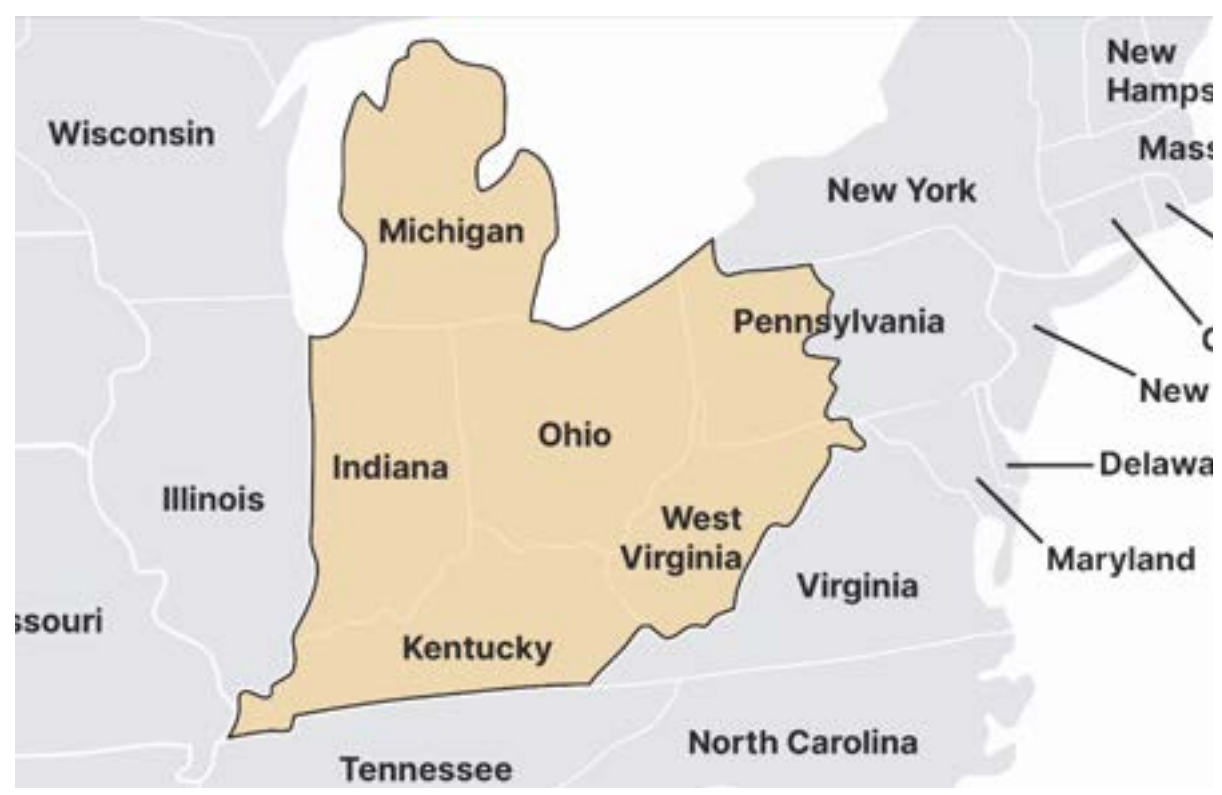
SESCO will represent Flexeserve in key Midwestern areas

Specialising in a full range of kitchen solutions and already supporting a variety of partners in commercial refrigeration, cooking appliances and foodservice dispensers, SESCO needed <a href="https://high-quality.hot-holding.equipment">high-quality.hot-holding.equipment</a> to complete their comprehensive offering to customers.