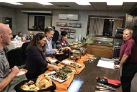
SESCO test kitchen discussions and demonstrations

As well as a collaborative effort to improve the foodservice industry, SESCO is also keen to deliver on a service that meets both brands' ideals.