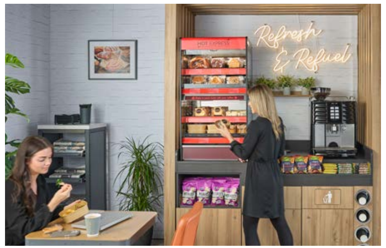
Transform your food-to-go programme with Flexeserve

SESCO has been actively promoting new and innovative products for over 30 years. With the addition of the Flexeserve range, including these new units specifically designed for the Americas, a wider audience can now achieve true hot-holding.