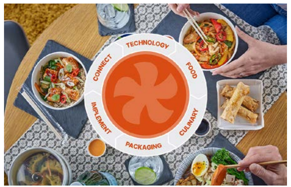
Flexeserve Solution, the industry's only service for true hot-holding

Uniting every facet of Flexeserve's incredible customer offering, from menu development and technology to testing cook methods and training team members, Solution changes the game for any operation. Now, adding SESCO's own expertise into this process, Midwestern customers can achieve even more.