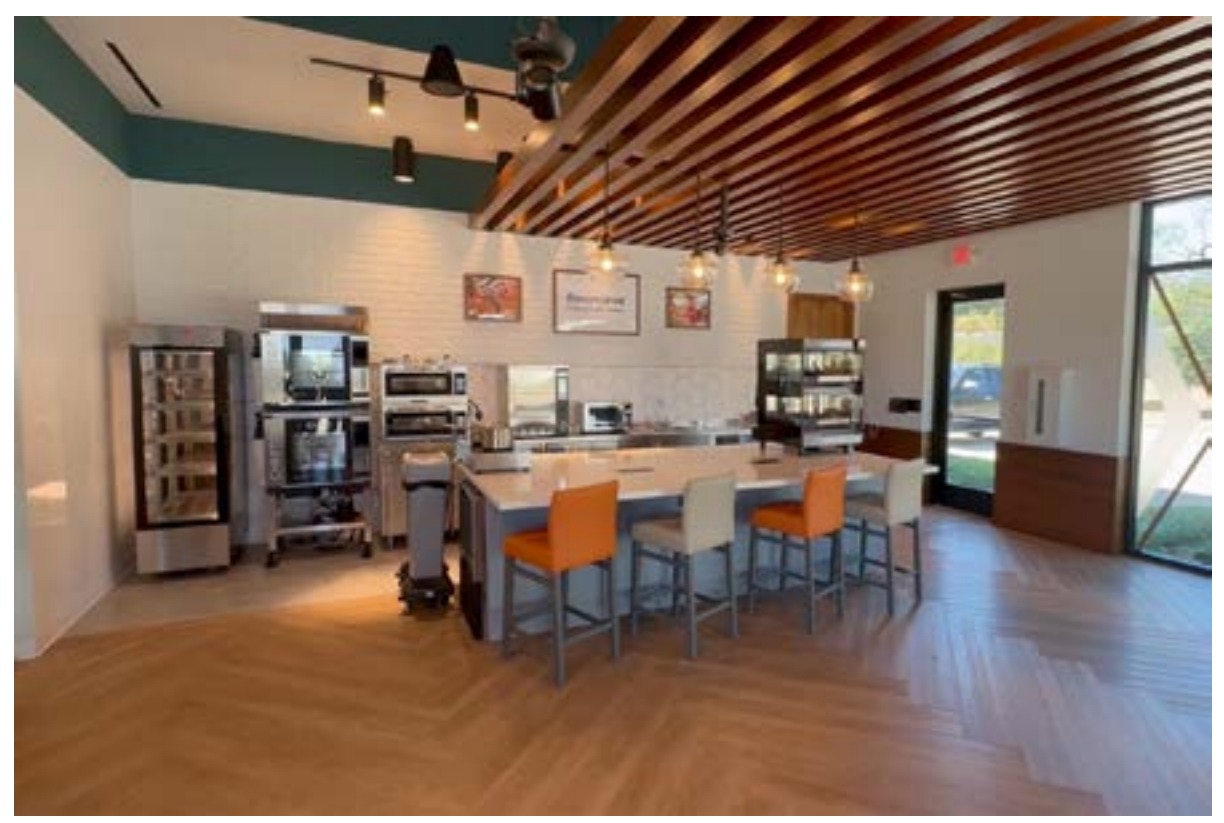
Flexeserve Inc.'s cutting-edge Culinary Support Center – fully equipped with a modern ventless cookline and a large food preparation area for collaborating with customer food development teams