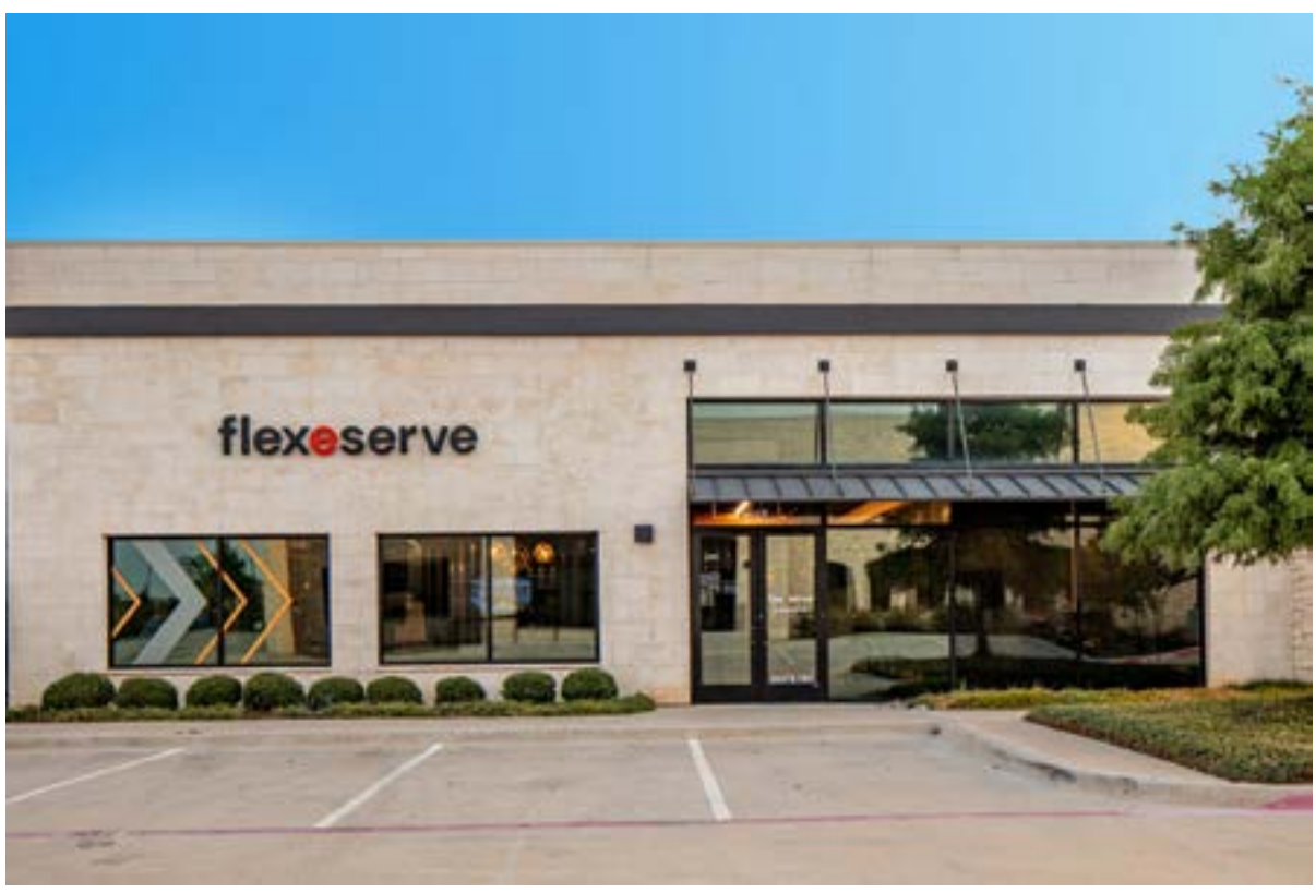
Flexeserve's HQ and Culinary Support Center in Southlake, Dallas, TX