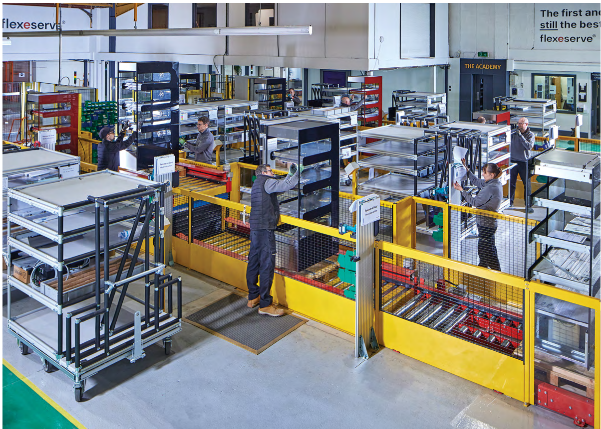
Flexeserve's state-of-the-art manufacturing facility