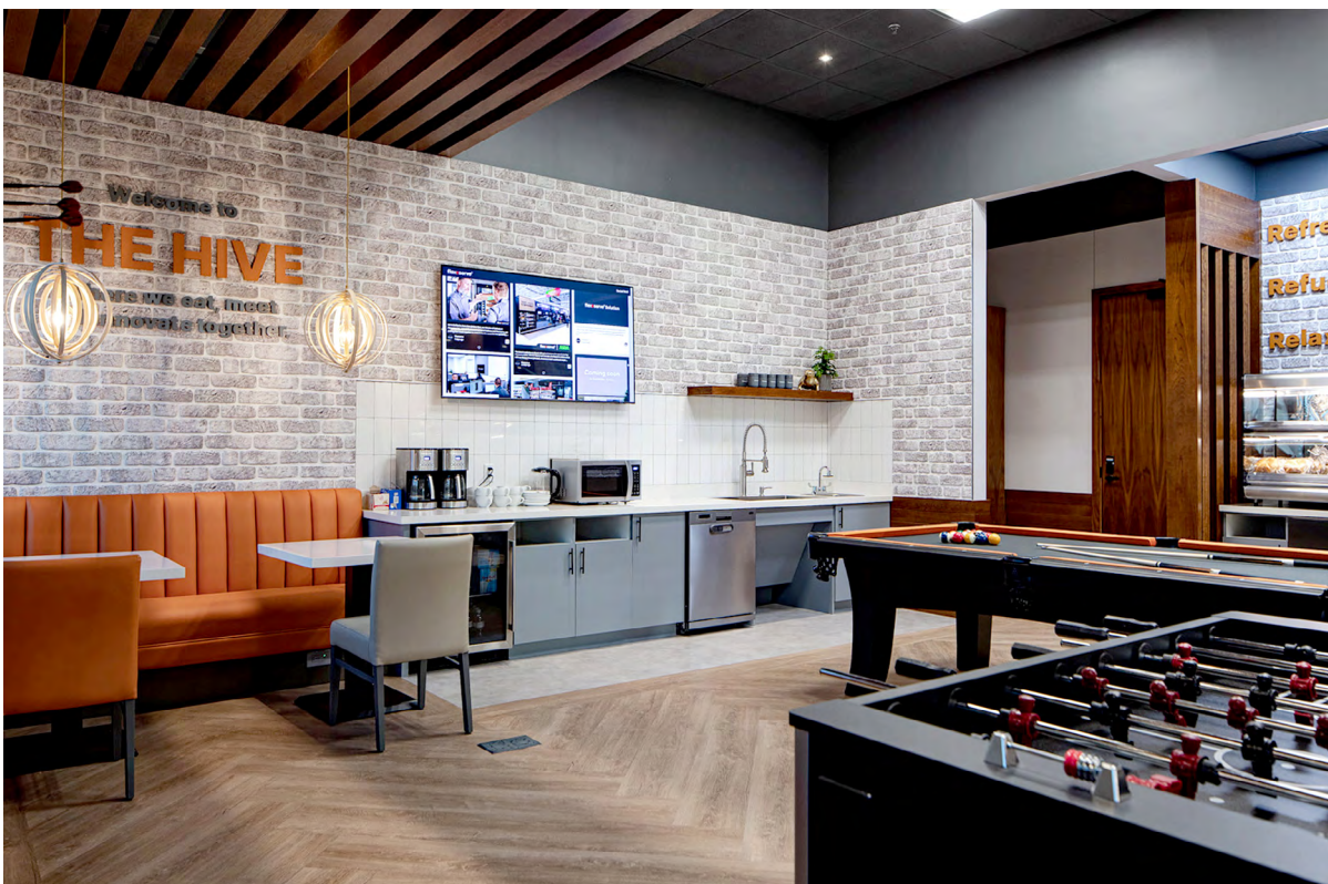
The Hive – where Flexeserve's hot food experts with their customers and rep partners can eat, meet and innovate together

For more information, visit www.flexeserve.com