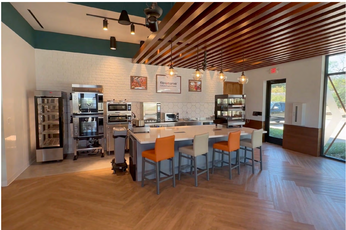
Flexeserve Inc.'s cutting-edge Culinary Support Center – fully equipped with a modern ventless cookline and a large food preparation area for collaborating with customer food development teams