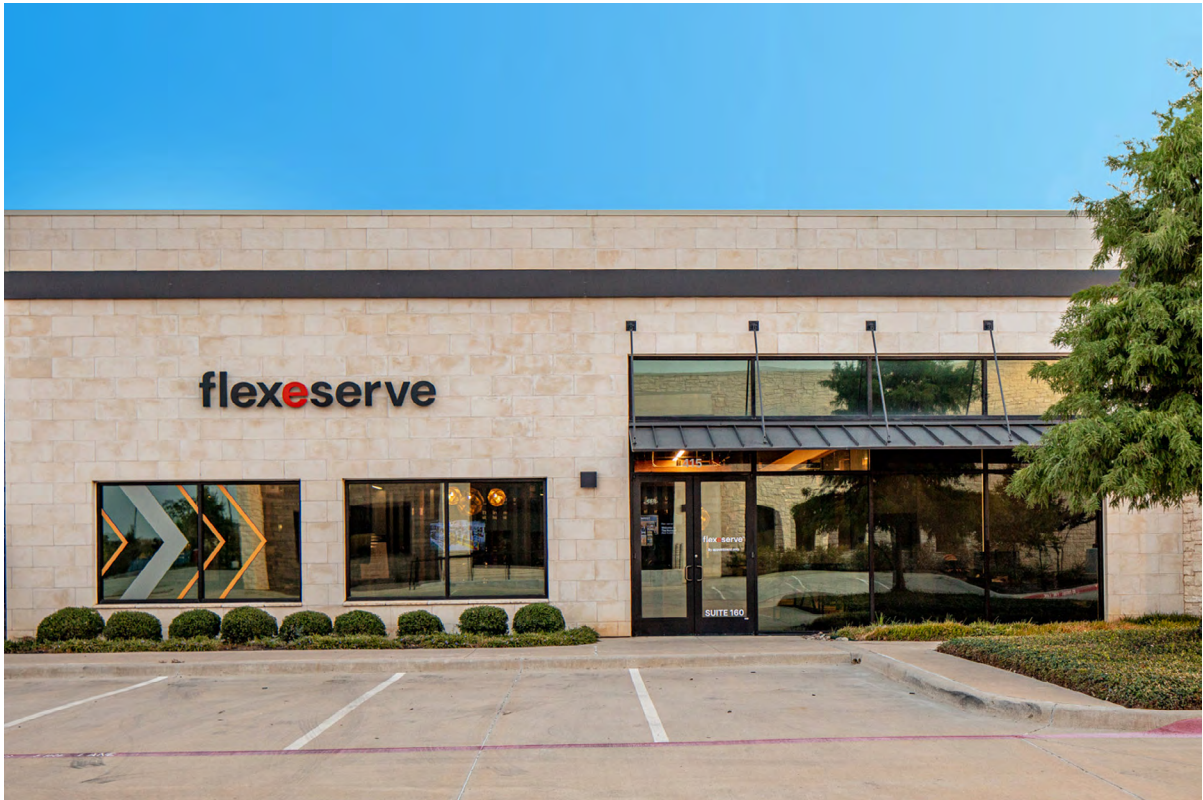
Flexeserve's HQ and Culinary Support Center in Southlake, Dallas, TX