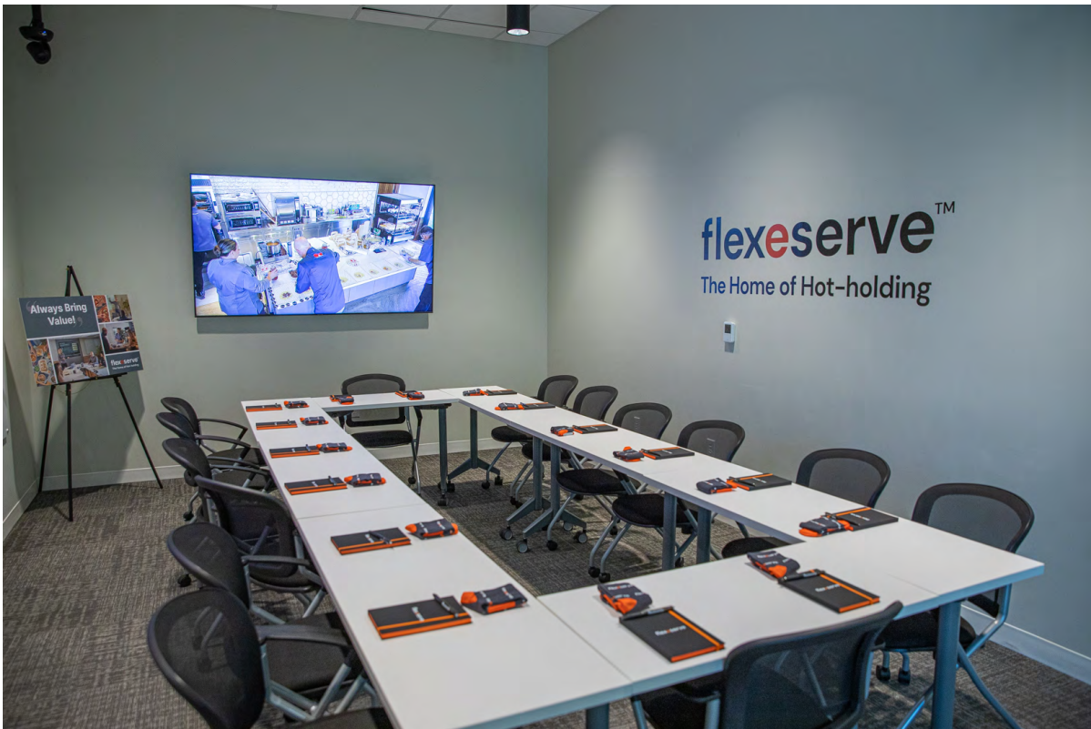
The Studio and Training Room – featuring a direct video link to the Culinary Support Center and installed with the latest digital technologies for customer collaboration and remote demonstrations