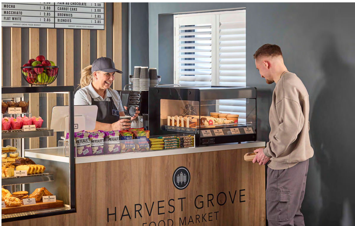
The ultra-lightweight and stackable Flexeserve Zone Lite uses a 120V power supply to offer better portability than ever

“Lite is joining our entire countertop range for its debut at NAFEM,” Conrad continued. “Featuring an ultra-lightweight and stackable design, Lite uses a 120V power supply to offer better portability than ever. It’s perfect for adding incentives and LTOs to any location, boosting extra sales right around the store.”