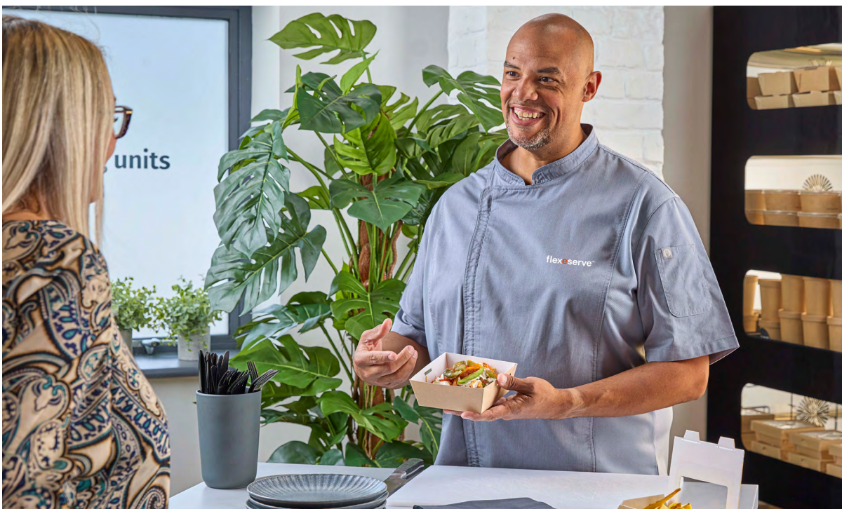
Flexeserve's team of specialists work tirelessly alongside customers to revolutionize their entire program, from menu options all the way to implementation

This expanded team now operates from a state-of-the-art U.S HQ in Southlake (DFW Metroplex), Texas. Featuring a cutting-edge Culinary Support Center, an extensive showroom and a fully equipped Studio and Training Room – it certainly shows Flexeserve’s dedication to its customers in the Americas.