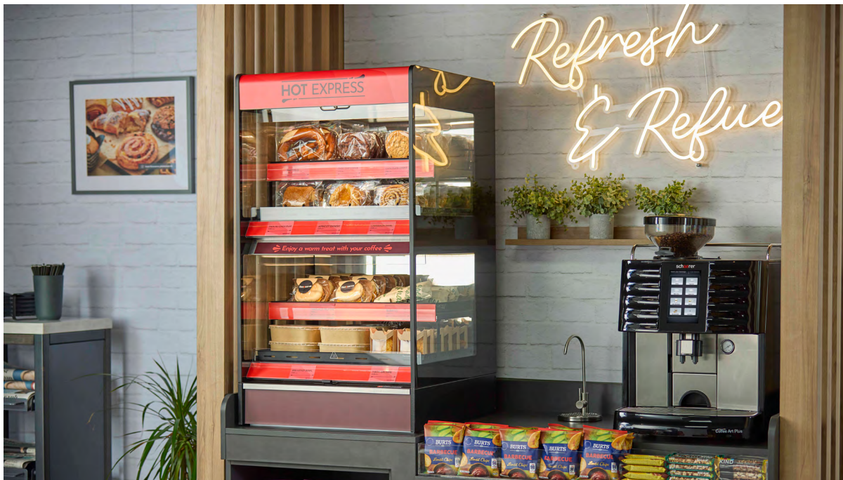
Flexeserve Zone Xtra 2 Tier provides 80% more food capacity within the same footprint and power supply as a standard countertop heated display

Since the last show in 2023, Flexeserve , the global leaders in hot food-to-go, has injected considerable investment into its U.S.-based team. Now, they're ready to wow The NAFEM Show 2025 with their biggest presence yet and brand-new products that are set to make a statement. This is all part of a continued mission to help an even wider range of customers unlock true hot-holding, so they can sell more and waste less.